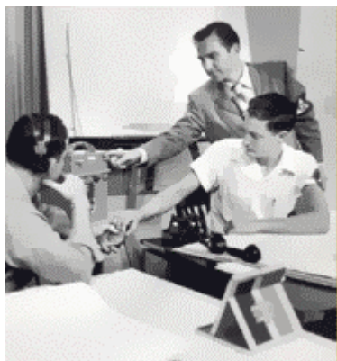
← Civil Defence Radio Class; 1950s

I knew that the Defense Civil Preparedness Agency is now known as the Federal Emergency Management Agency (FEMA). It is responsible for federal assistance in emergencies such as natural or man-made disasters or defense-related incidents. A visit to the FEMA library in downtown Washington revealed more about DIDS and WGU-20.